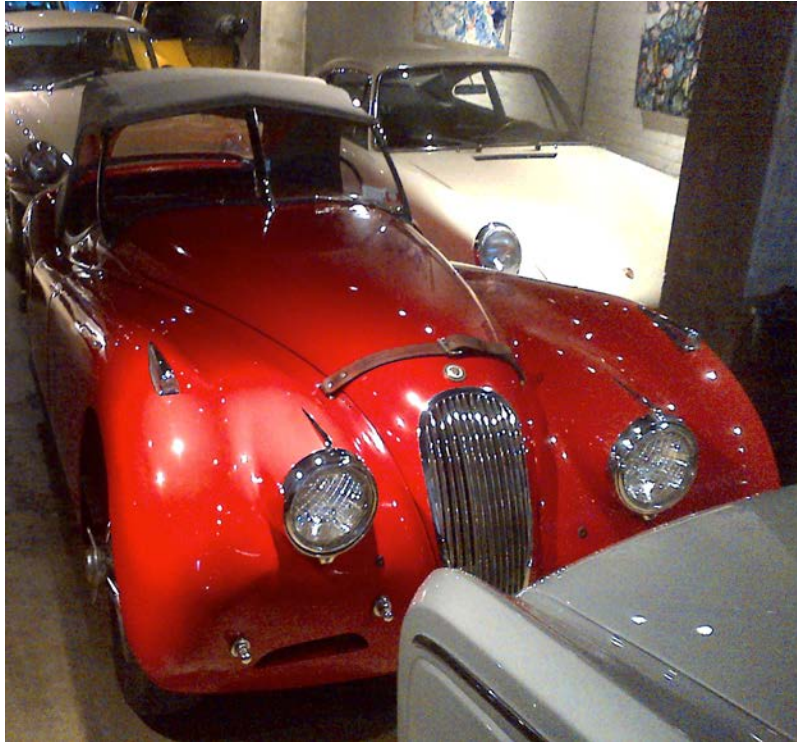
LA VEILLE DU TRANSPORT AU PORT